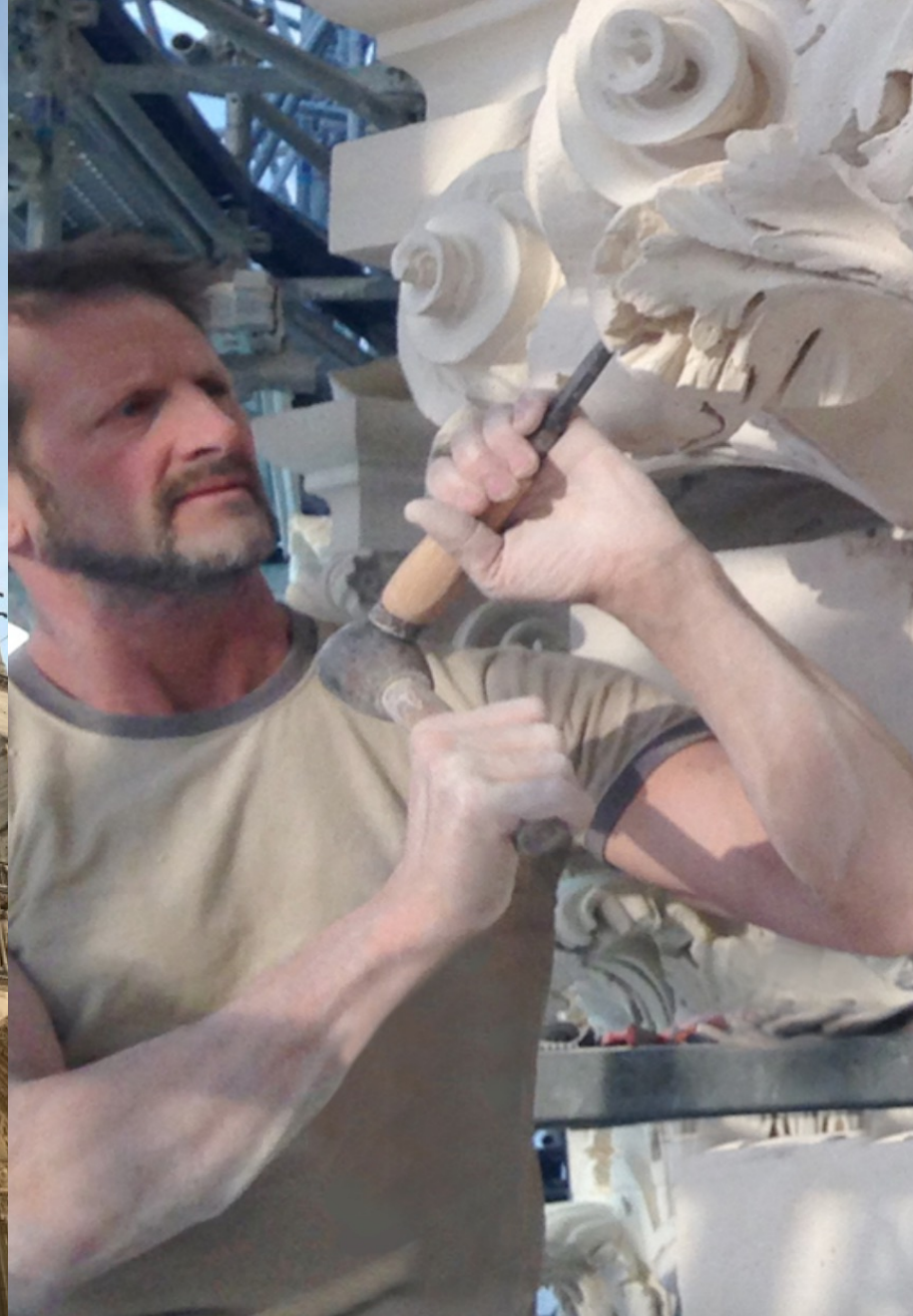
Meet an artisan who worked on Notre-Dame reconstruction