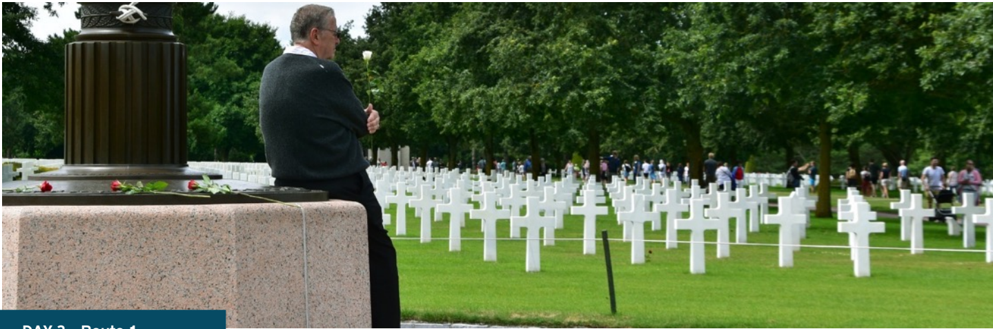
DAY 2 - Route 1